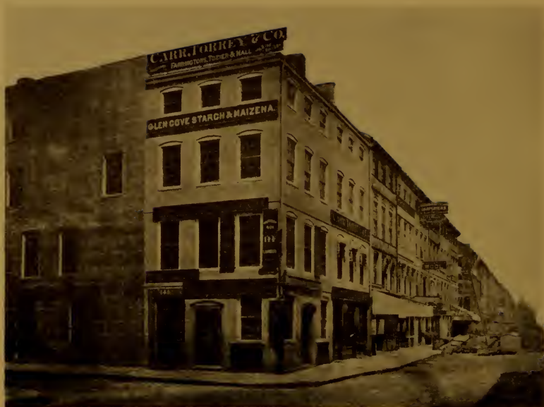
Crown Coffee House and Fidelity Trust Co. Site in 1872